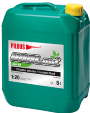
COOLcut Eco 65

In addition to use in saw bands the product is designed for machining operations carried out both on conventional machines and NC and CNC machining centres.