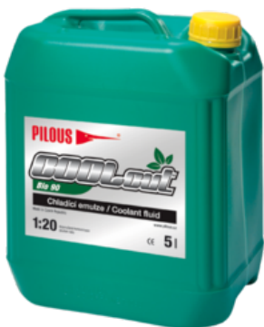
COOLcut Bio 90

In addition to use in saw bands the product is designed for machining operations carried out both on conventional machines and NC and CNC machining centres.