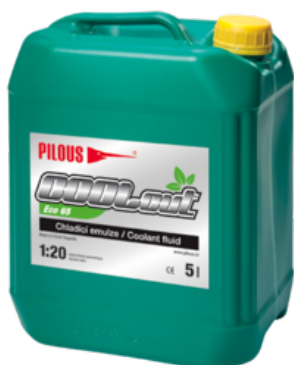
COOLcut Eco 65

In addition to use in saw bands the product is designed for machining operations carried out both on conventional machines and NC and CNC machining centres.