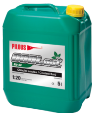
COOLcut Bio 90

In addition to use in saw bands the product is designed for machining operations carried out both on conventional machines and NC and CNC machining centres.