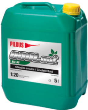
COOLcut Bio 90

In addition to use in saw bands the product is designed for machining operations carried out both on conventional machines and NC and CNC machining centres.