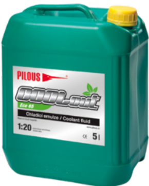
COOLcut Eco 65

In addition to use in saw bands the product is designed for machining operations carried out both on conventional machines and NC and CNC machining centres.