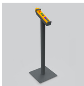
OPM - M

Support for increasing the load capacity (approx. 5 t), stiffness and stability of the log deck. By using the support, the dynamic load of the deck and thus its service life will be significantly increased.