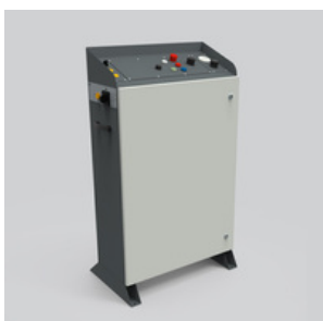
OPM - XL

Extended version of the basic control panel including a switchboard. It allows you to control multiple components of the XMK line.