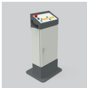
OPM - L

It defines the lower position of the log loader. It is designed to connect to a sawmill.